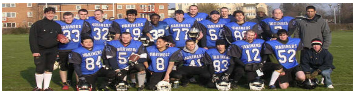
The Mariners – Collegiate Team