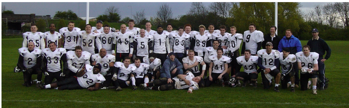
The Exiles – Senior Team