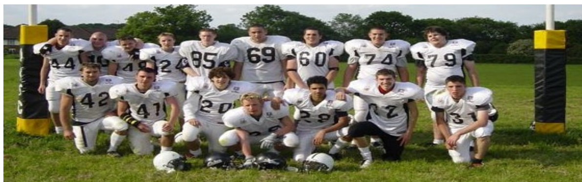
The Brewers – Youth Team