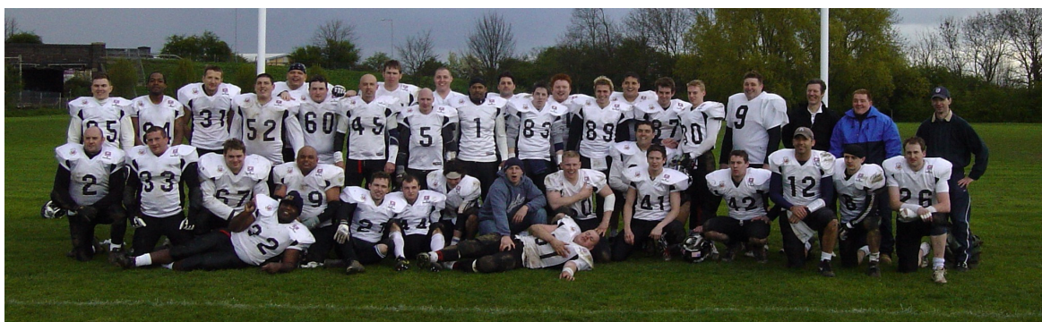
The Exiles – Senior Team